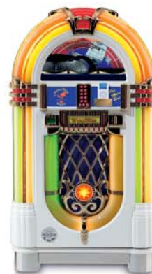
Drawer with docking station and iPod